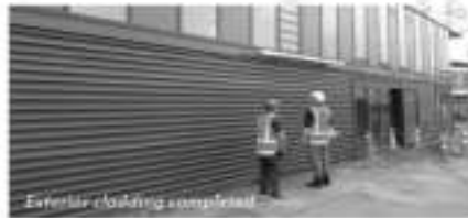
Exterior cladding completed

Once the building is completed, construction will start on the town square, car park area and the inside spaces will be fitted out.