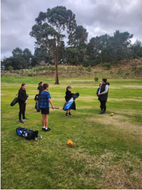
Some photos of the Youth Club below: