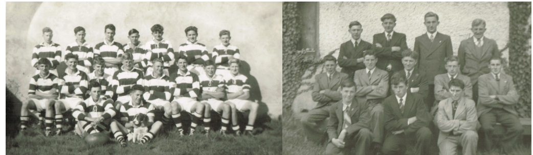
Flock House Buchanan's

Don't forget the Flockhouse reunion looming very soon.